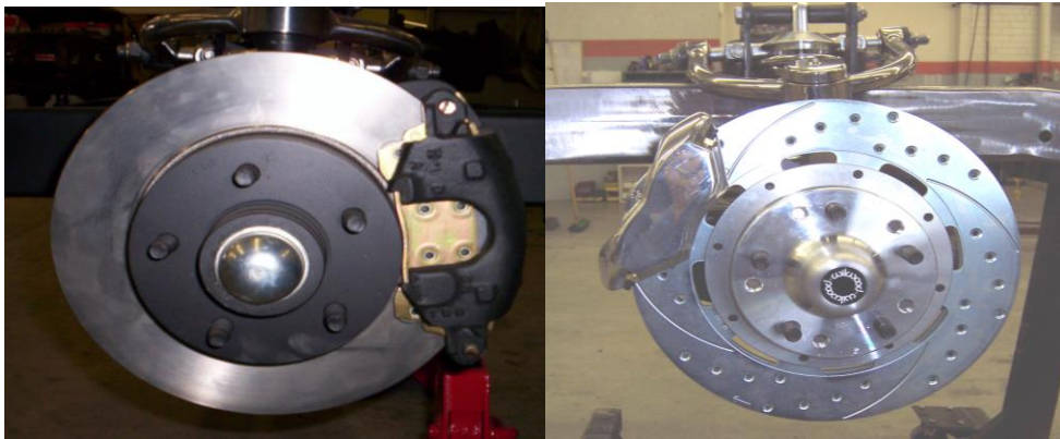
OE 11" standard

We have several options from Master Power, CPP and Wilwood. CPP front kits use a Corvette style sealed hub which means no bearings to pack and 13" Corvette drilled/slotted rotors with matching calipers. Master Power brakes all include drilled/slotted hub style 1-piece rotors and have either late model OE calipers or their billet 4-piston calipers. Complete Wilwood big brake kits are available that use aluminum hubs, 4 or 6 piston aluminum calipers with 11" to 14" rotors. Drilled rotors and polished calipers are options on these kits.